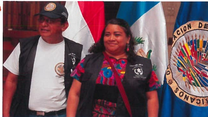
Indigenous Judicial Facilitator from Guatemala.